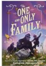
The One and Only Family By: Katherine Applegate

Dive in to one last adventure with Ivan, who is living happily in a wildlife sanctuary. Soon, he and Kinyani will navigate the joys and challenges of parenthood with their twins.