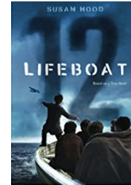
Lifeboat 12 By: Susan Hood

A group of British boys struggle to survive in a lifeboat when the ship taking them to safety is attacked. Based on the true story of Ken Sparks.