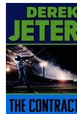
The Contract By: Derek Jeter

Eight-year-old Derek dreams of being the starting shortstop of his favorite team, the New York Yankees, but he has to get through Little League first! Derek faces the challenge of being a leader on and off the field while striving to be a champion.